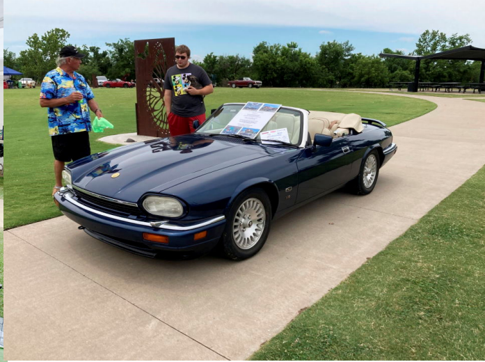
A beautiful XJS from Joplin Mo.

We had a lot of items for the silent auction and a great place to display them on the stage.