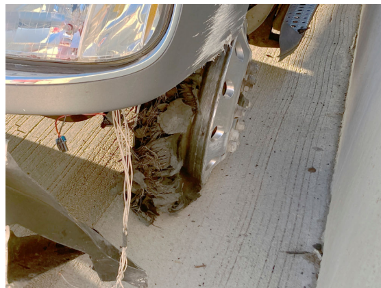
A really sad truck tire.