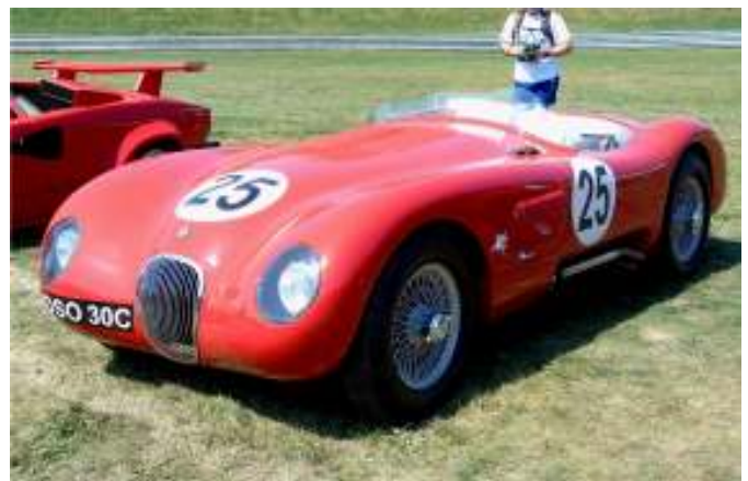
C Type Jaguar