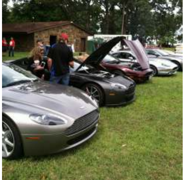
A row of Aston Martins There were lots of English cars there!