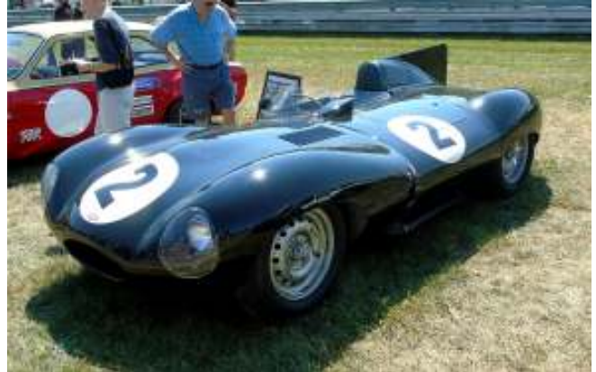
D Type Jaguar