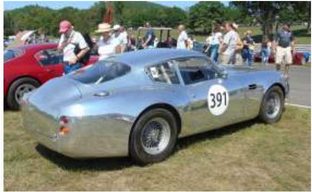
All aluminum Aston Martin

Lime Rock used to be way out in the country but somehow the population growth has spread to surround the track and now people who don't understand racing complain about the noise disturbing their weekends. (They fail to realize just how much money the track brings in to their community!) The result is endless lawsuits (so far the track is winning) and no racing on Sunday. To counter that the track now holds what has to be one of the biggest car shows on the east coast on Labor Day weekend Sunday with over 1000 cars attending. We saw some amazing vehicles.