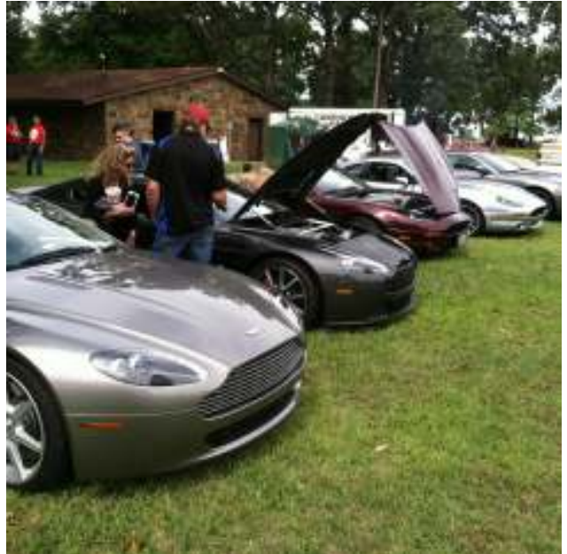
A row of Aston Martins There were lots of English cars there!