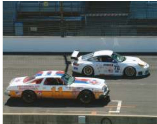
An inside pass on the Indy main straight.