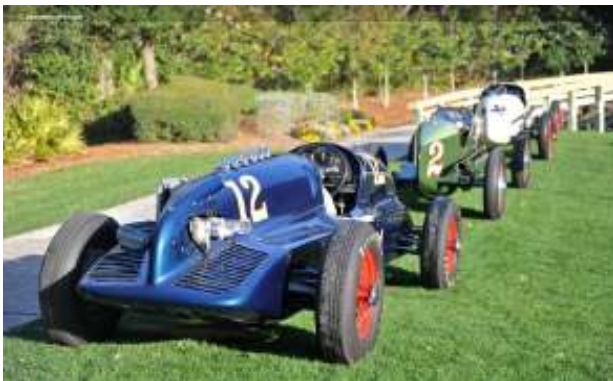
Gulf-Miller (# 12) at an Indy car show.