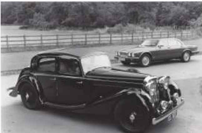
The SS Jaguar 2 1/2 litre saloon in the photo was

The saloon was introduced to the public in a ceremony in the Mayfair Hotel in London. William Lyons invited all his guests to guess the price of the new luxury car and most of the guesses came in around £600. William Lyons announced the price was £385 and the crowd rose to their feet cheering. The car was a game changer in the automotive world.