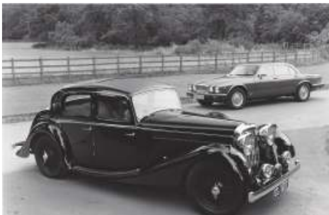
The SS Jaguar 2 1/2 litre saloon in the photo was

The saloon was introduced to the public in a ceremony in the Mayfair Hotel in London. William Lyons invited all his guests to guess the price of the new luxury car and most of the guesses came in around £600. William Lyons announced the price was £385 and the crowd rose to their feet cheering. The car was a game changer in the automotive world.