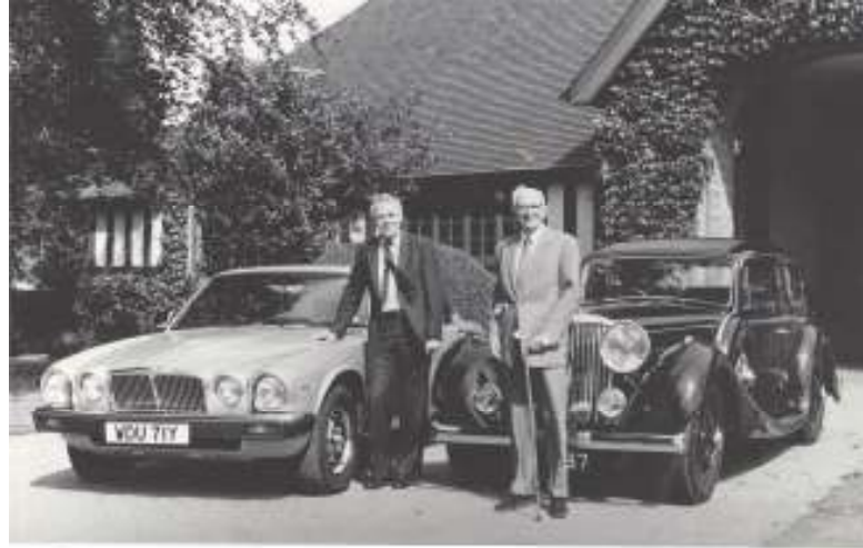
JAGUAR Sir William Lyons (right) Founder of Jaguar with Chairman John Egan. Flanking them are a 1937ss Jaguar and a Jaguar XJ6.

Such was the popularity of the new marquee that within two years, new manufacturing techniques were introduced to permit production to rise and in the fiscal year ending July 31st 1939 production exceeded 5,000 SS Jaguars for the first time.