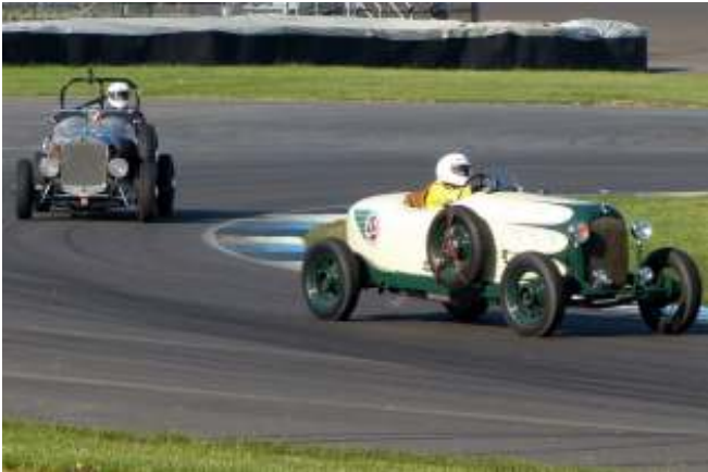
At Indy, 2014

Last year I raced only the 1933 Plymouth and that will probably continue for 2016. If you haven't seen this car it's an old dirt track racecar that has a wonderfully constructed "speedster" type body. It currently has all the correct 1933 equipment: flathead 6 engine, steering, suspension, brakes. To put it mildly, it's an interesting drive. And also SLOW. With the current setup top speed is about 75 mph. Consider that my Pre-War class often contains Alfa Romeos, Maseratis, Bugattis and Stutzes, and you can get an idea of where I finish. MGTC's are my closest competitors, and I can usually beat the Morgan trikes.