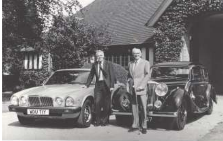
JAGUAR Sir William Lyons (right) Founder of Jaguar with Chairman John Egan. Flanking them are a 1937ss Jaguar and a Jaguar XJ6.

Such was the popularity of the new marquee that within two years, new manufacturing techniques were introduced to permit production to rise and in the fiscal year ending July 31st 1939 production exceeded 5,000 SS Jaguars for the first time.